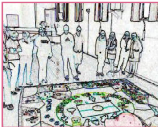
Every year student groups view the AIDS Memorial Quilt as a way of improving understanding about the personal impact of this disease.

Some ideas of key topics are listed opposite. Please indicate your choices and return. If you wish to discuss any of the topics please contact the HIV/AIDS Health Promotion Officer.